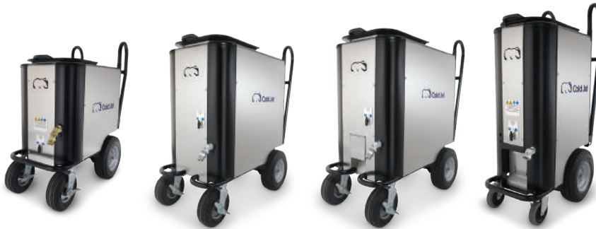
Aero 40/40 HP

The Aero Line offers superior performance and versatility with or without electricity. Regardless of the size of your project or budget, from the compact Aero 40 to the all-pneumatic Aero C100, Cold Jet has the right solution to meet your needs. Contact Cold Jet to determine the best solution for your application.